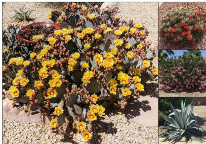
Clockwise from left: Diploid Prickly Pear, Hedgehog, Oleander, American Agave Brought to you by the SCW Desert Garden