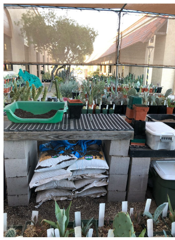
Following the brutally hot, dry summer, this outside potting station was a busy place to replace so many plants that did not survive into the fall. By December, the walkway next to the Beardsley Pool was repopulated with hundreds of large plants being rooted and then sold to the residents.