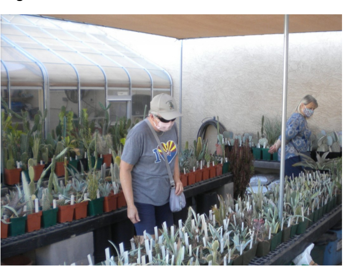
After making an appointment, two ladies check out the smaller plants. The number of people in the area was limited to ten or fewer to help prevent the spread of COVID-19.