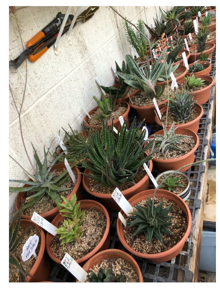
Thank goodness that many of the "mother" plants in the greenhouse made it through the summer shutdown. These plants were not for sale as they were maintained to produce "pups" or new plants which then could be potted up for sale.