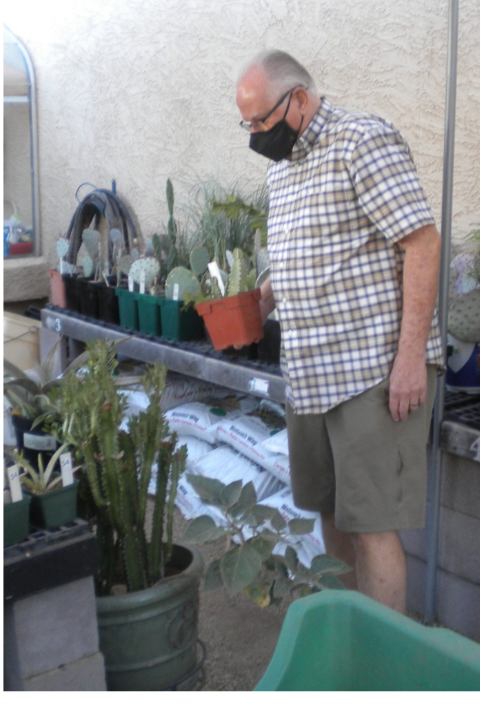
A Sun City West resident shops for some Moroccan Mound plants. To control the spread of COVID-19, the plant sales were limited to SCW residents only. They had to register their Recreation Card numbers which were recorded for contact tracing if necessary.