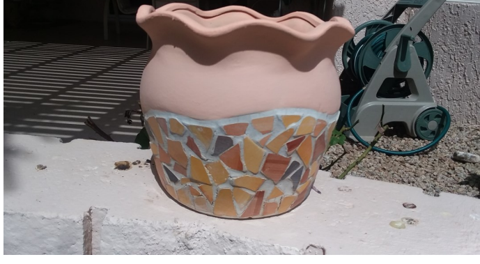
Using a variety of techniques, Sandy Warmuth turns plain pottery into dynamic vessels that will soon be filled with a variety of plants at the cactus garden section of the club's sales.