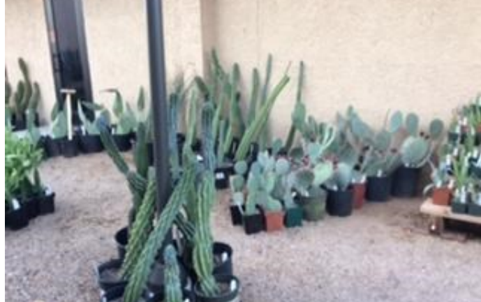
Photo 6 of the new courtyard arrangement.