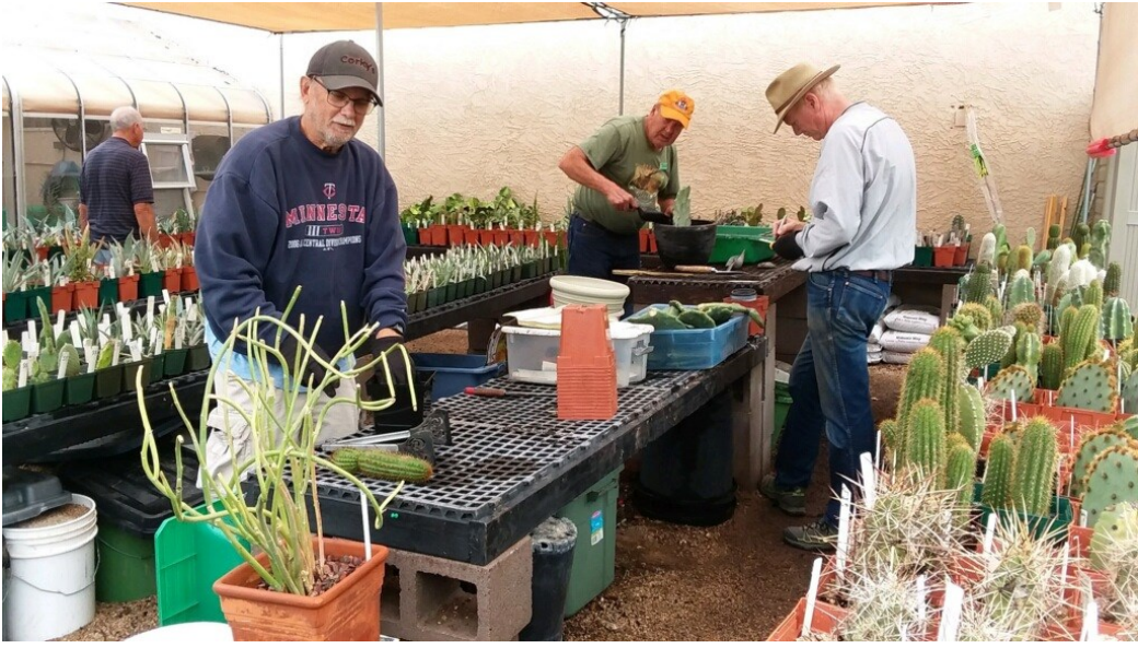
Before the Covid-19 shutdown of all SCW facilities at 4 pm on March 13, nearly two dozen club members rushed to the greenhouse to get the plants and cuttings into pots.