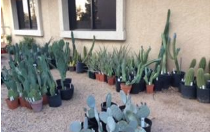
Photo 4 of the new courtyard arrangement.