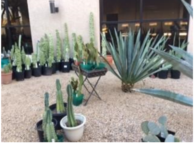
Photo 2 of the new courtyard arrangement.