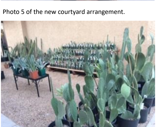
Photo 7 of the new courtyard arrangement.