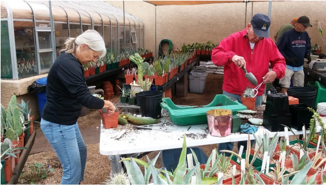
With a mere 24 hours notice, well over 300 plants and cuttings were prepped, potted and set out to grow roots during the Covid-19 shutdown. Special potting stations were set up to handle the volume.