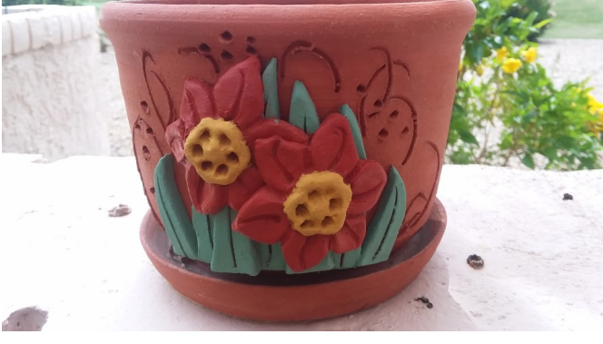
This pot by Sandy Warmuth will be filled with several cacti as soon as the greenhouse is open for activity. Artistic pottery set off the plants for quicker sales..