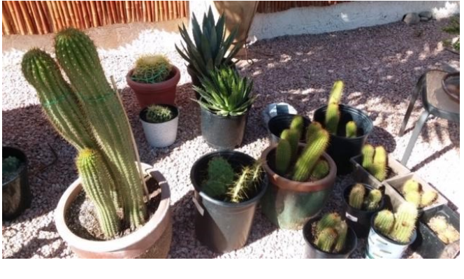
Golden torch cacti and a variety of other plants grow for Denise Wirz and Sandy Warmuth.