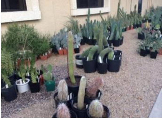
Photo 3 of the new courtyard arrangement.