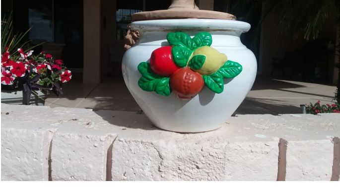
Talented garden club member Sandy Warmuth spent part of her coronavirus shutdown painting and refurbishing pots. Most plants were grown in plain plastic pots.