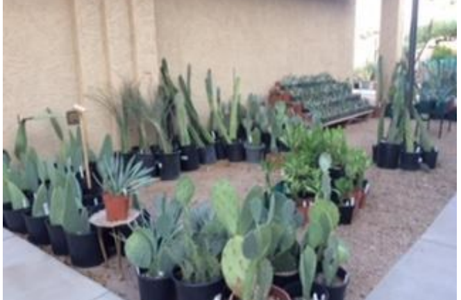
Photo 5 of the new courtyard arrangement.