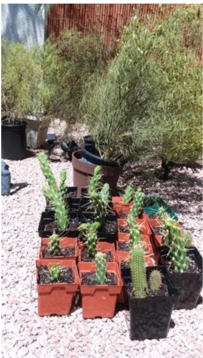
Not content to just rescue plants, Denise Wirz and Sandy Warmuth also gathered up plants, pots, and soil and then potted up several specimens.