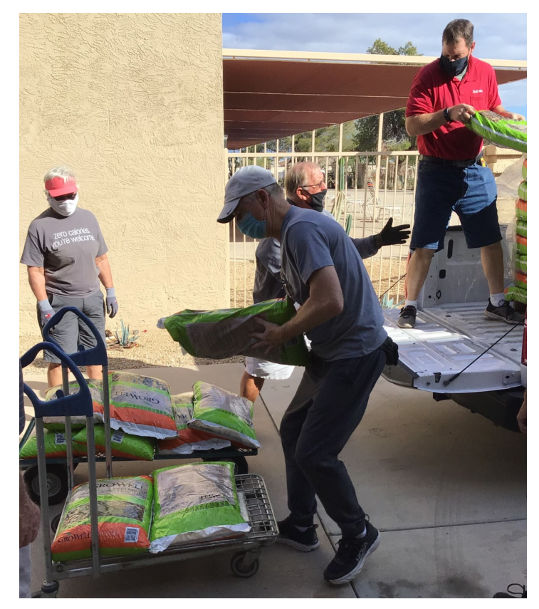
Even though scheduled sales were on hold due to COVID-19 precautions, it was necessary to order another pallet of cactus soil in January