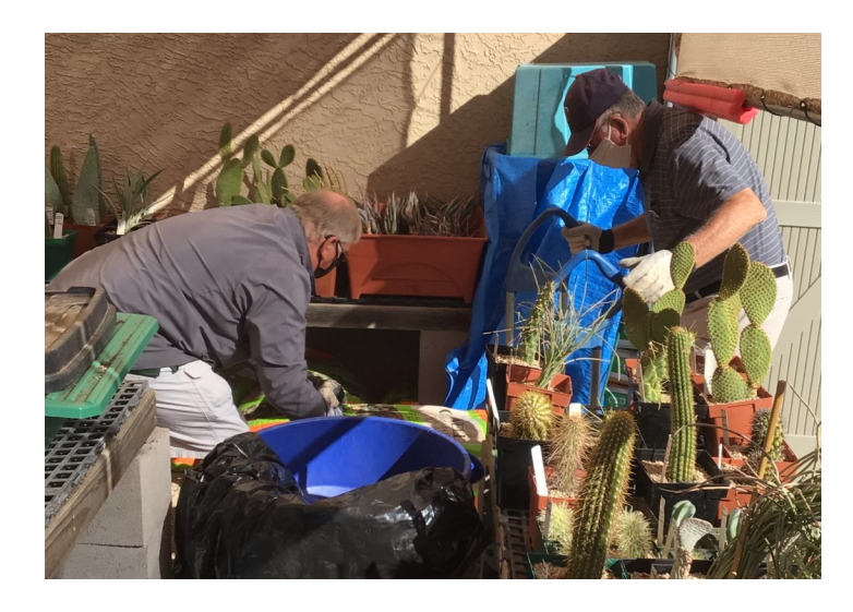
Teamwork makes it easier to stack the soil under the benches.