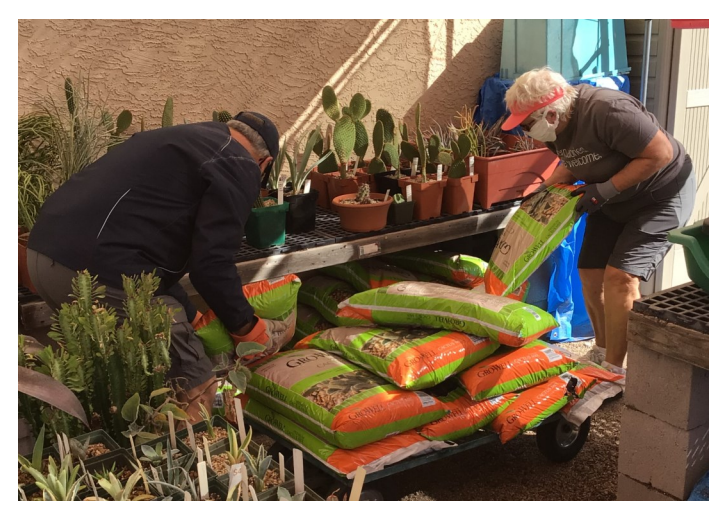
With only a few more loads to go, nine more bags go into storage.

Using five carts and the club's wagon, the bags of soil quickly move from the truck to the shaded area by the greenhouse.