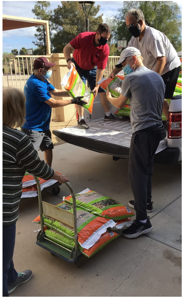
An assembly line system makes short work of the six feet tall pile of bags.