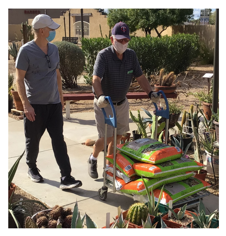
The final cart load heads in before the last bag is put away at 2:20 pm. Only eighteen minutes and everyone was headed home!