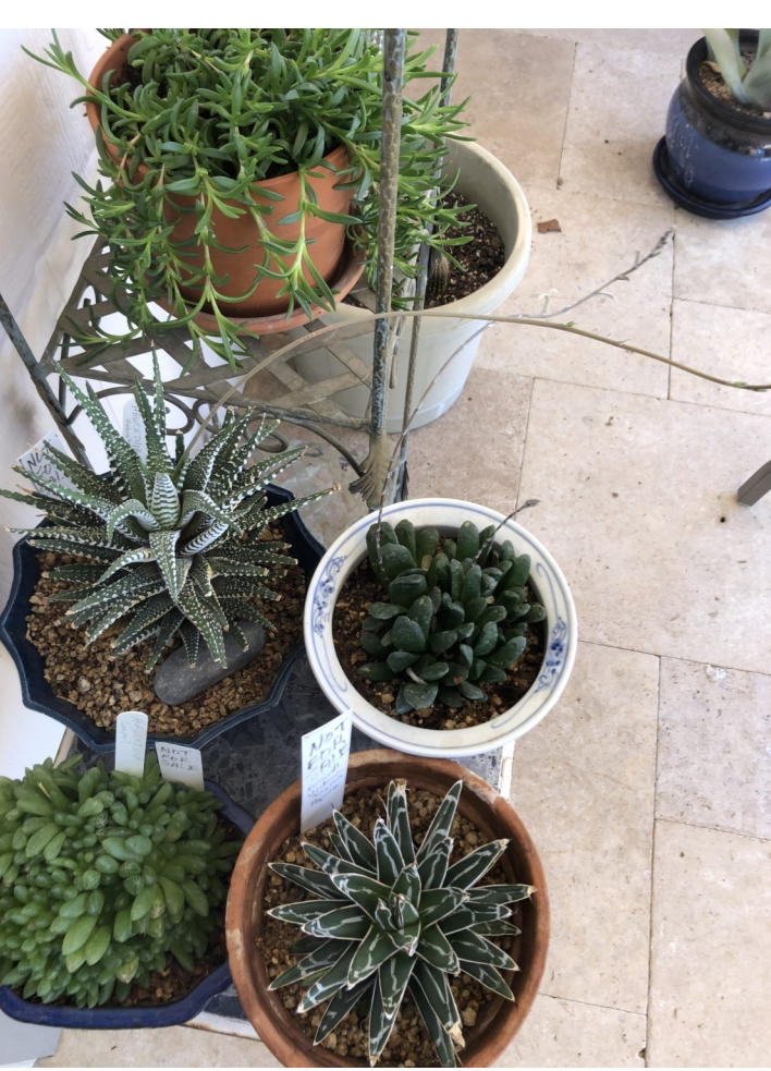
Several "Mother" plants on the patio.