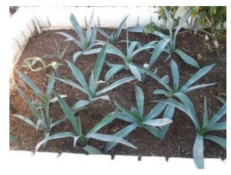
The raised beds at Denise Wirz"s house provides a great place to grow some blue agave.