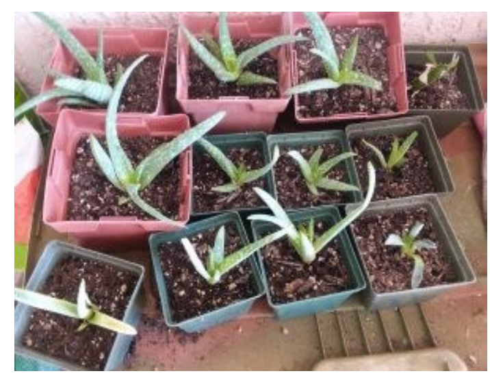
Several Aloes were propagated by Sandy Warmuth.