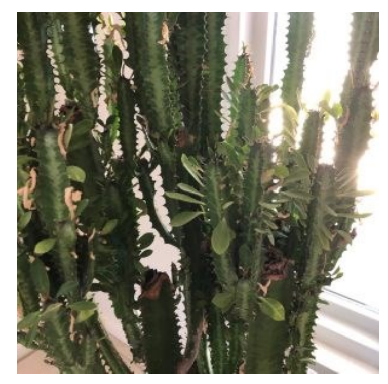
Lynn Krabbe and Bruce Kilbride. tended for two different African Milk Trees.