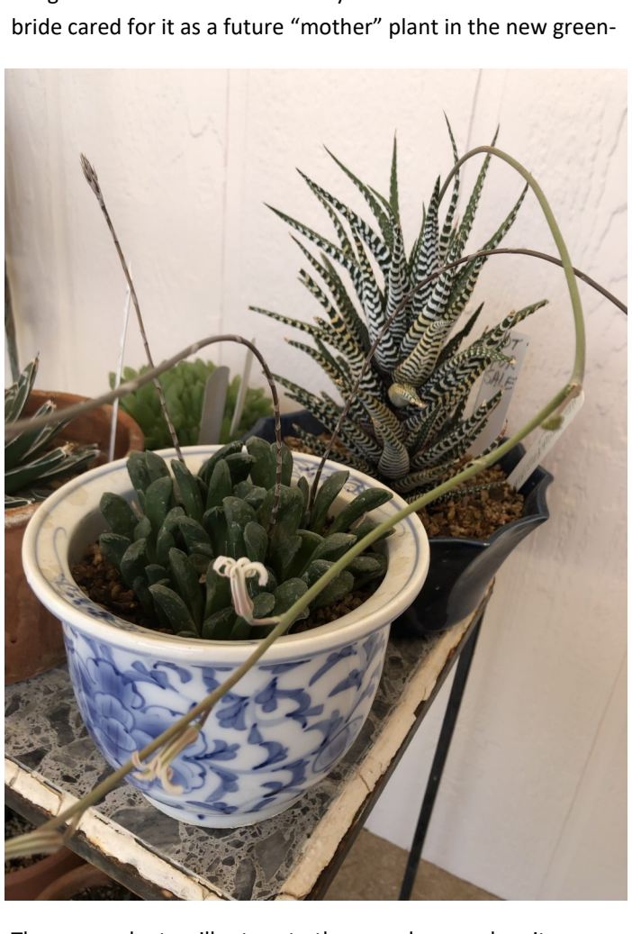
These succulents will return to the greenhouse when it opens.