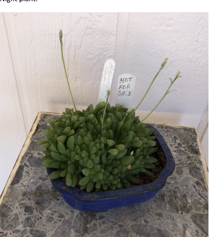
This plant is thriving under a club member's care while the new greenhouse is built.