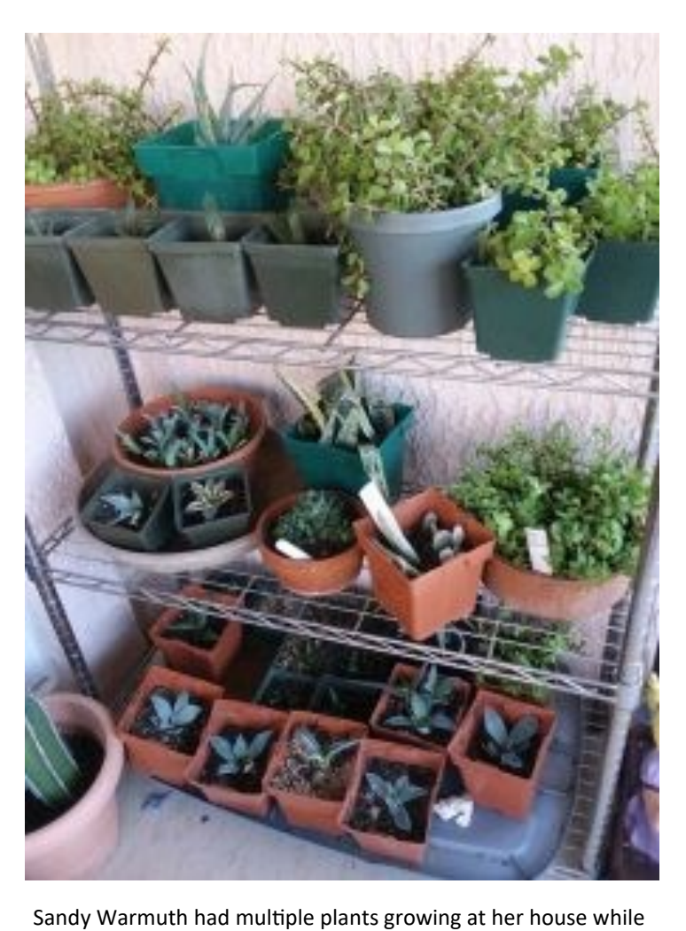
waiting for the new greenhouse to be finished.