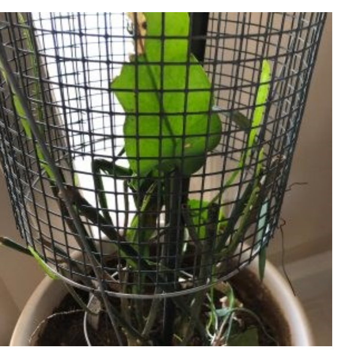
The Queen of the Night Plant was donated shortly before the old greenhouse was torn down. Lynn Krabbe and Bruce Kil-