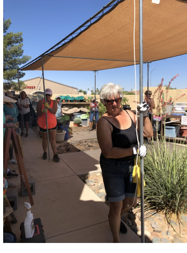
Everyone has to be quite careful to move at the same speed and use extra care as they move through and over the two retention ponds.