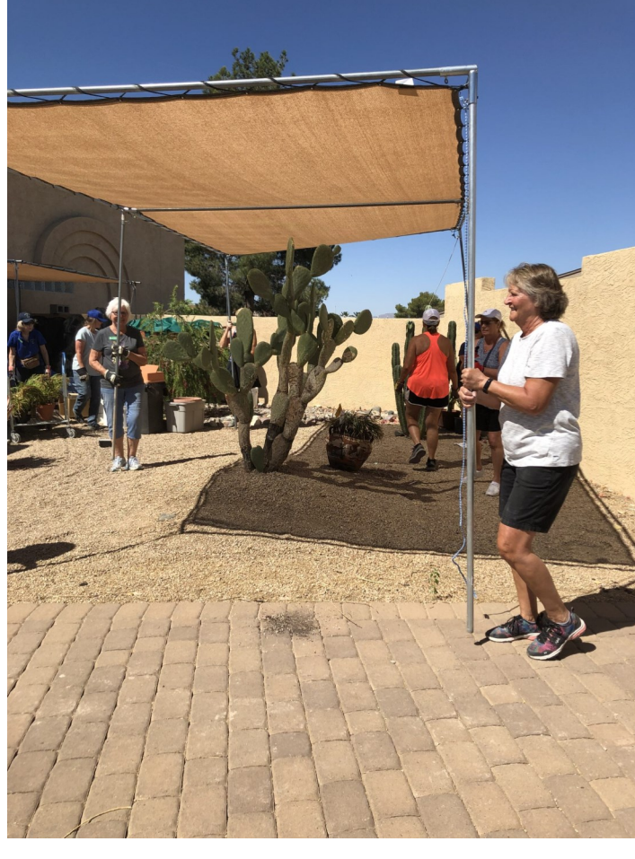
Once the construction was complete, it is time to move the shade cloth from one side of the courtyard to the other side near the new greenhouse.

As soon as the larger plants arrive in the "Alley," they are covered with shade cloth to protect them from the brutal sunshine.