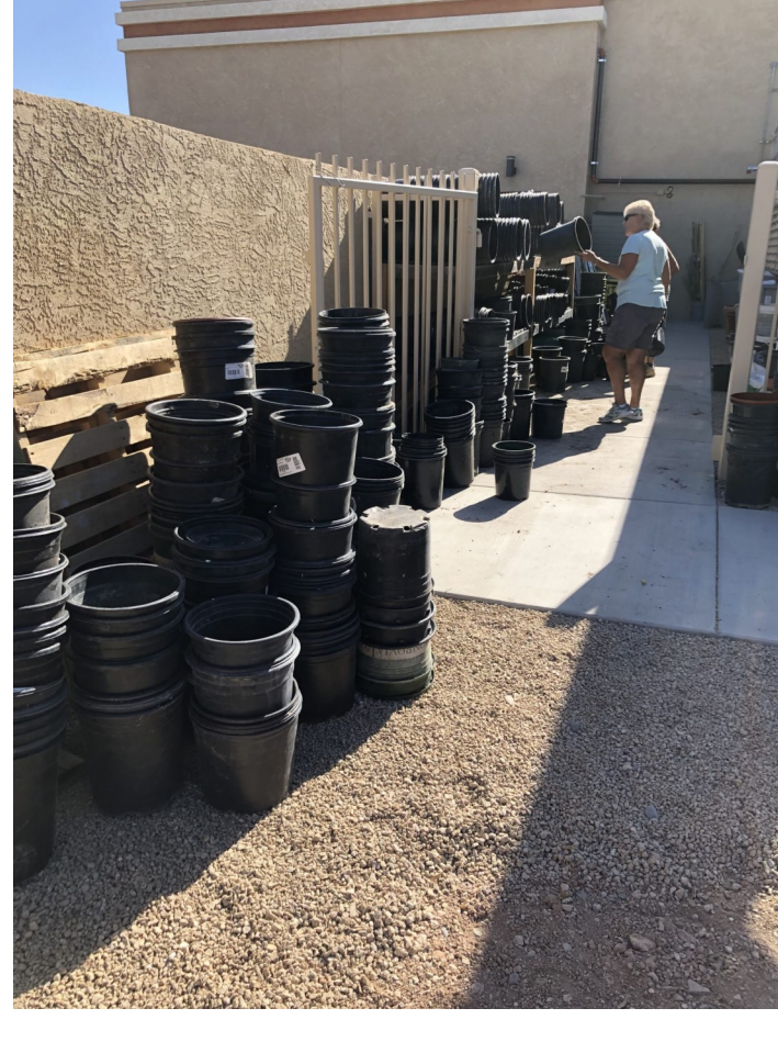
Hundreds of post are sorted and put away in the storage area on the side of the greenhouse.

Moving the shade cloth is a team effort with one person on each post and a couple others supervising to make sure the unit is high enough to clear the plants and lamp posts along the way.