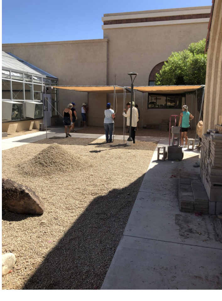
The shade cloth was split into two ten foot by twenty foot pieces before moving to the side of the new greenhouse.

Moving the shade cloth is a team effort with one person on each post and a couple others supervising to make sure the unit is high enough to clear the plants and lamp posts along the way.