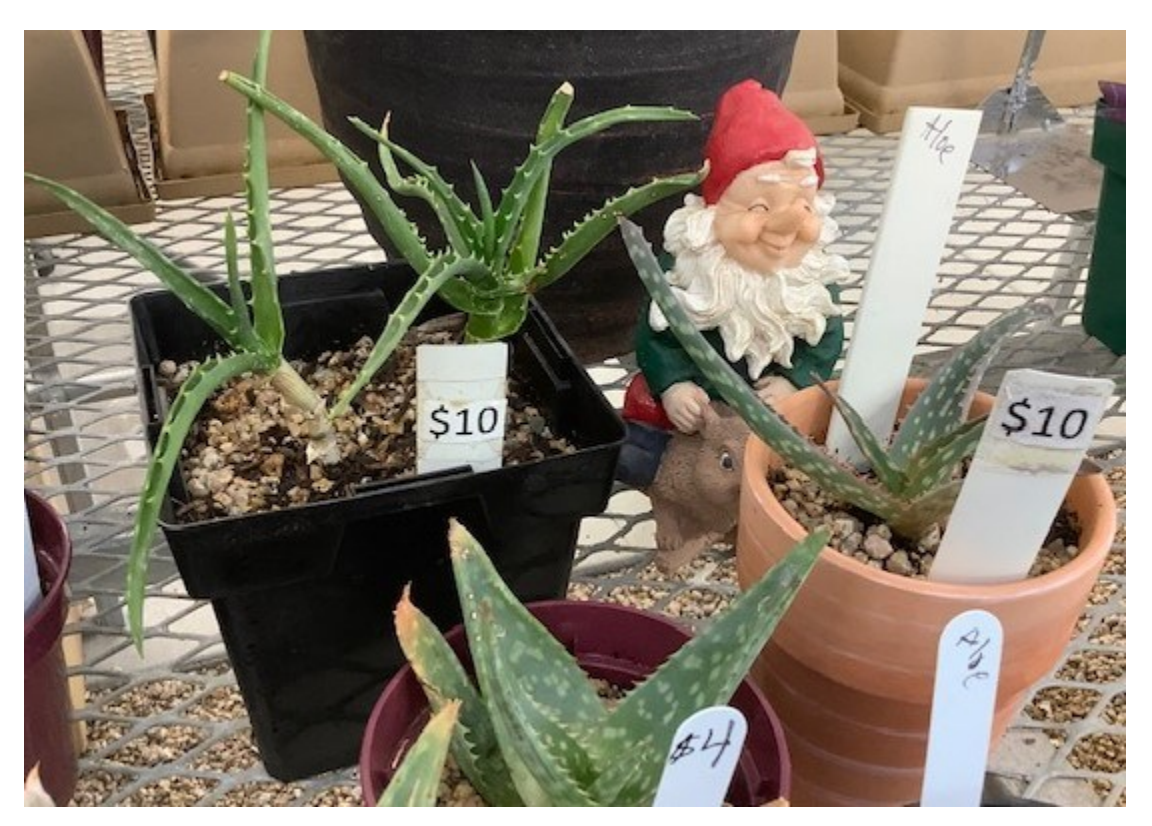
The Christmas spirit shows up inside the greenhouse.