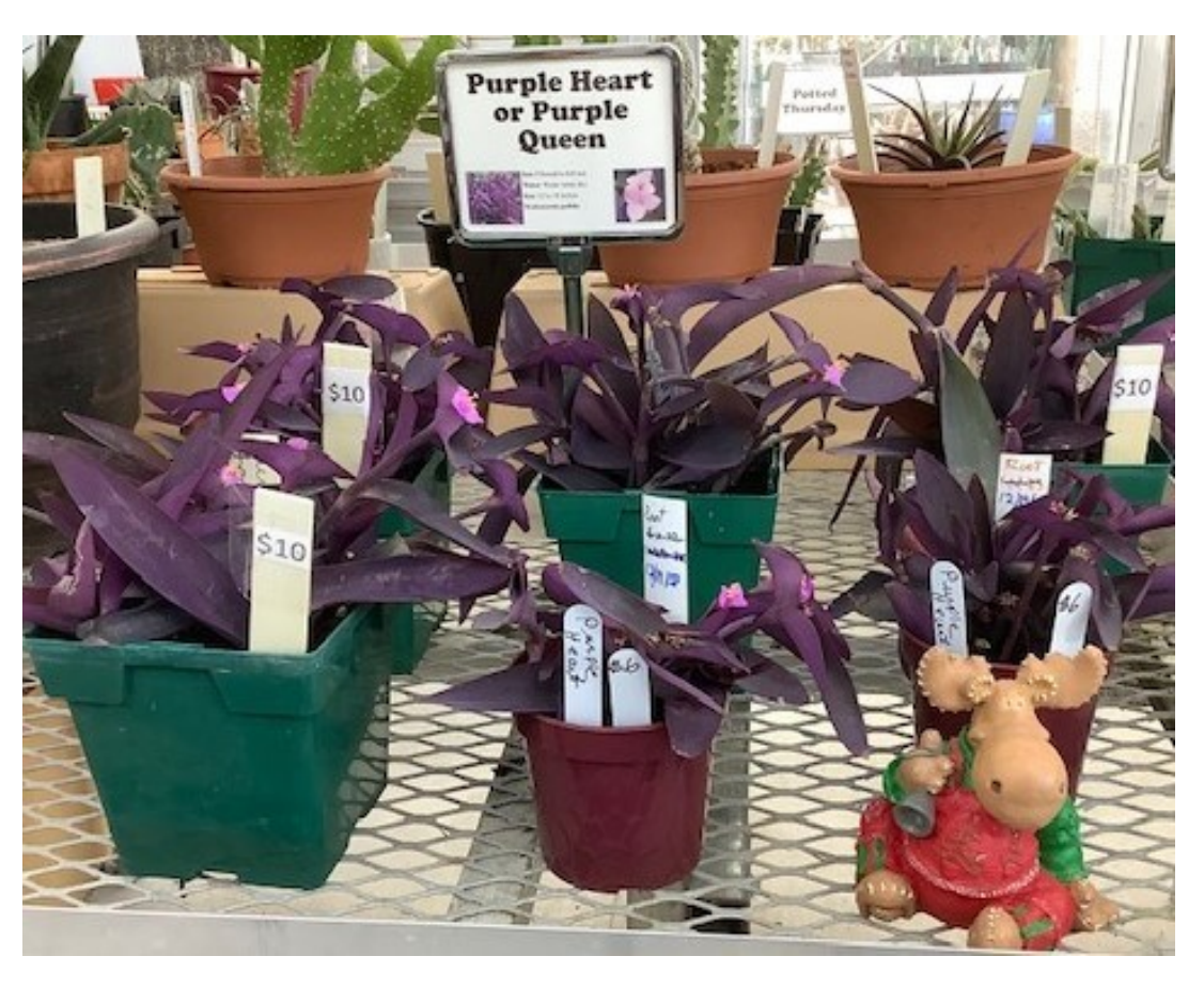
Even though they were not the typical desert cactus, Purple Hearts were always in demand as they add color to anyone's garden.