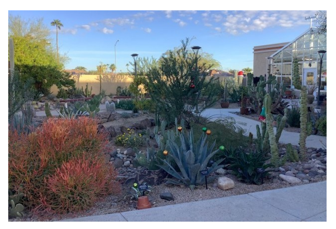
Decorations for the holiday season bring some additional color to the Botanical Garden outside the greenhouse.