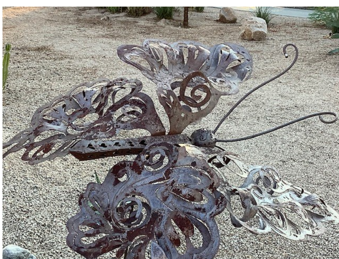
Randy Rubattino installed this butterfly art work as part of the landscape improvement in the area between the Rec Center and pool