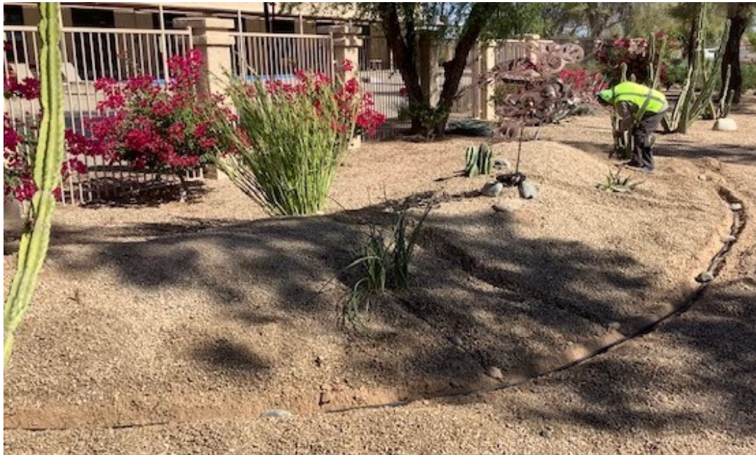
The new landscaping between the buildings required new irrigation lines to be installed.