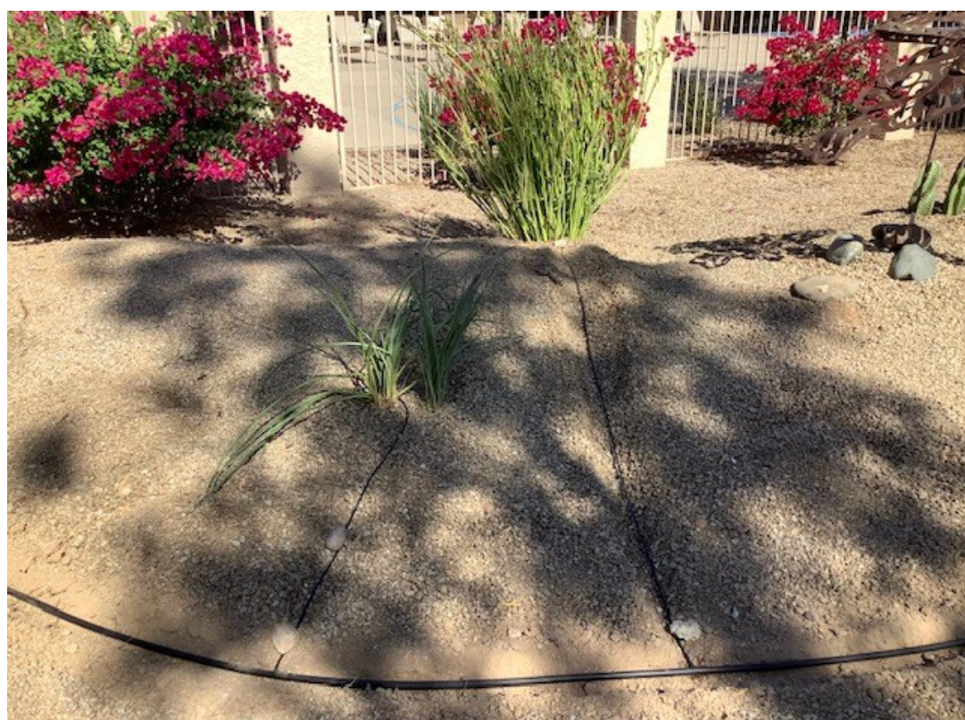
While the primary irrigation lines were put in by the SCWR crew members, it was up to club member Diana Phippen to run the drip lines to the individual plants.