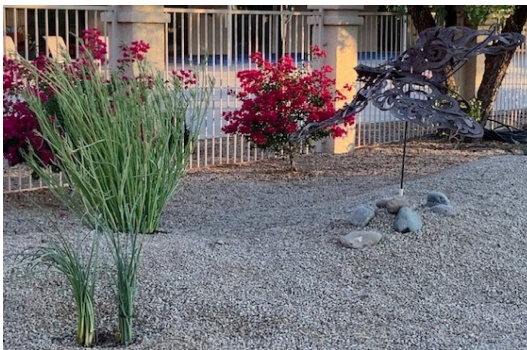
Under the direction of Botanical Garden Designer Pat Wanta, a clump of Lady Slipper plants and a couple yuccas improve the area near the