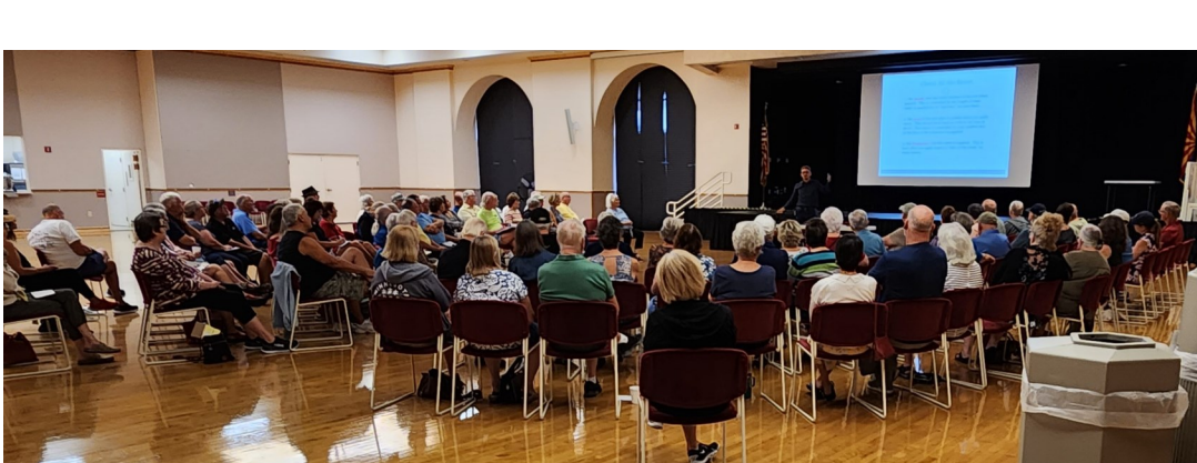
It was a good idea to move the November Workshop on xeriscaping to the hall in Palm Ridge as many club members were joined by other residents of Sun City West to learn how to design their yards with water conservation in mind.