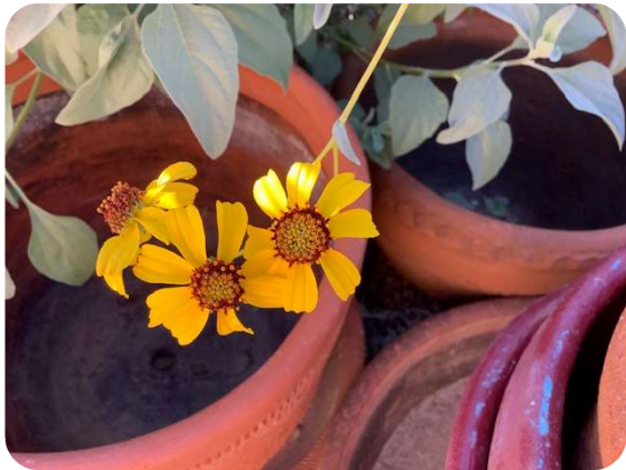
Brittlebush flower closeup...