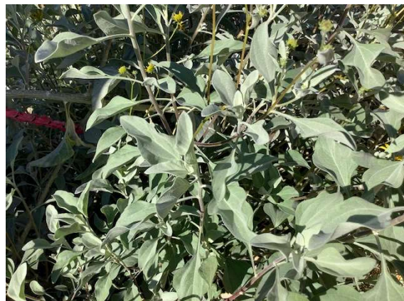
Brittlebush leaf structures...